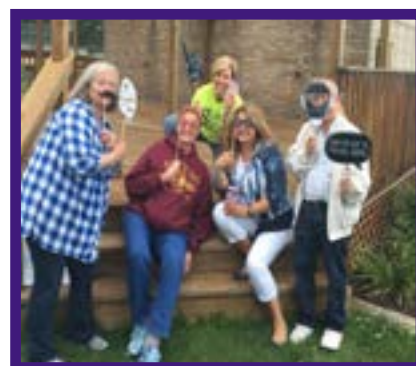
Movie in the park attendees enjoyed using photo booth props before the movie.