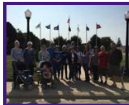
Cash mobbers set to mob the local hardware store in Walnut