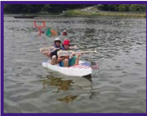
The winners of the 3rd annual cardboard boat regatta