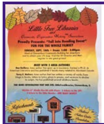
The poster for the Little Free Library event in Stewardson