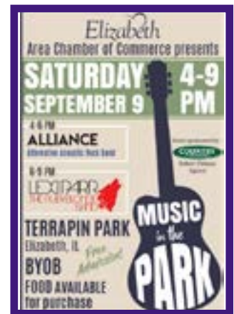
Poster promoting Elizabeth's Music in the Park program