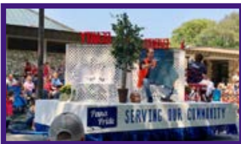
Pana Pride float in the Pana Labor Day Parade