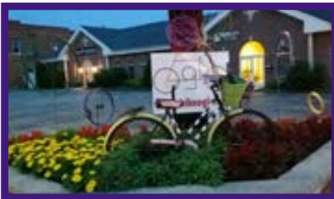
Decorated corner with beautiful landscaping and bikes in Oregon