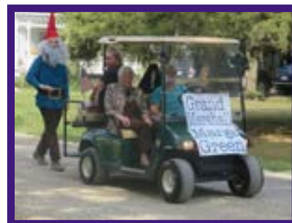
Strasburg Grand Marshal accompanied by a garden gnome!