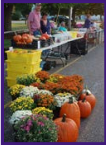
Fall mums and pumpkins at the LaHarpe Farmers Market