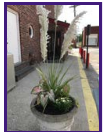
Findlay's pots decorated for fall