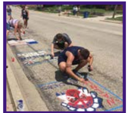
Patriotic Painting Party underway in Walnut