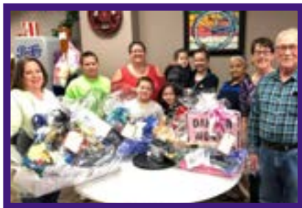
Basket Winners during Oregon Together's Chocolate Walk