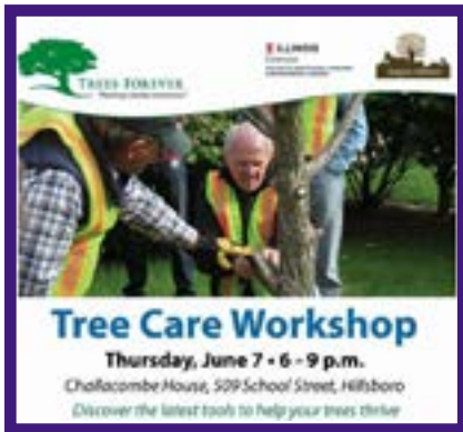
Poster for Hillsboro's Tree Care Workshop