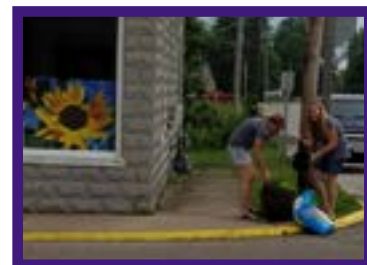
Volunteers planting flowers downtown in Downs