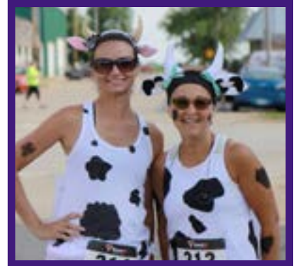
Participants getting ready for the 2018 Hoofin’ to the Cow race in Stewardson