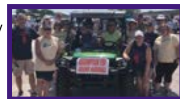
ACPA leading the parade in Assumption