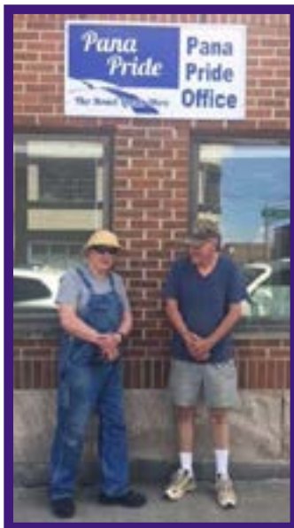
Pana Pride volunteers pose with the sign at the new Pana Pride office!