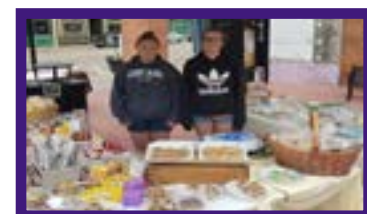
Youth selling baked goods during the Elizabeth Spring Fling