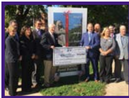
Stillman bank presents a check for the Blackhawk Statue Restoration Project in Oregon.