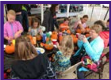
Painting Pumpkins during Fall Fest On Main in Walnut.