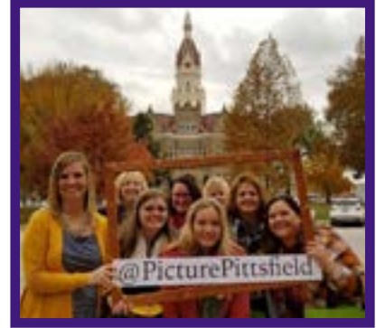
Ladies Night Out Participants take advantage of a Picture Pittsfield photo.