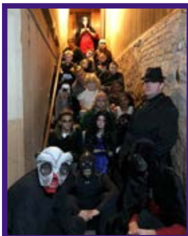
Volunteers ready to scare customers at the Winchester Haunted House.