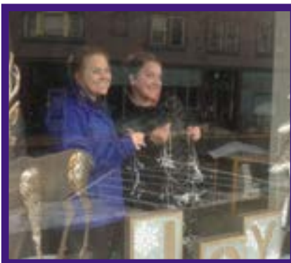
Volunteers decorated shop windows for Christmas in Erie.