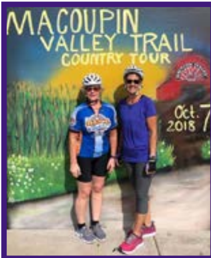
Riders take a break for a photo during the first Macoupin Valley Trail Country Tour.