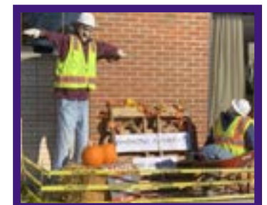
The Monroe Clinic in Durand created this display for the scarecrow competition.