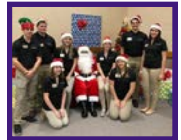
Hancock County CEO program organized Breakfast with Santa.