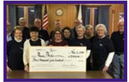
Members of Pana Pride accept a check for $3,500 from the Elevate Community Challenge.