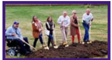
Grow Rushville Members break ground on the new Rushville Fitness and Community Center.