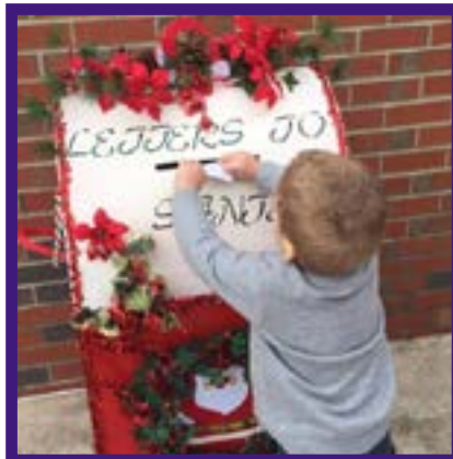
A child posting a letter to Santa in Hillsboro.