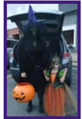
A couple of witches enjoying trunk or treat in Assumption.