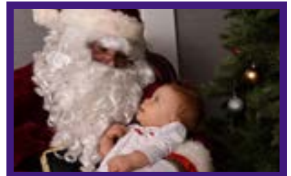
Pictures with Santa organized by COWS and the First National Bank of Waterloo.