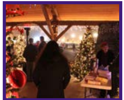
Participants enjoying cocoa during Sullivan's Old Fashioned Christmas.