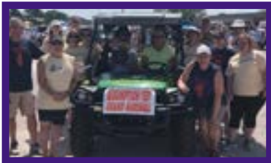
ACPA leading the parade in Assumption.