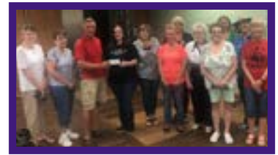
$10,000 was donated to the bike trail at the community meeting by Pass It Along, our local non-profit resale shop.