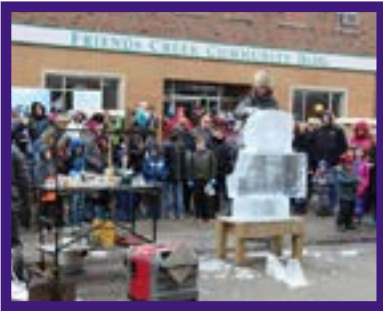
Participants enjoy a live ice carving demonstration during the 2nd annual Argenta IceFest.