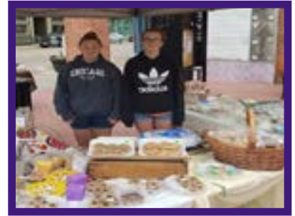
Youth selling baked goods during the Elizabeth Spring Fling.