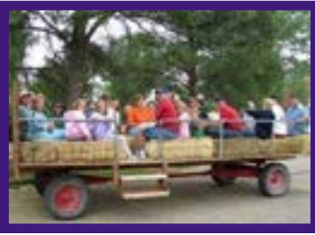
Residents enjoying a hayride in Durand.