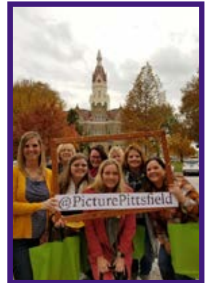
Pittsfield residents enjoying Girls Night Out with Picture Pittsfield.