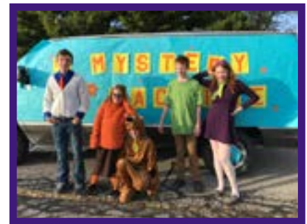
Kids in Downs getting ready for the 'trunk or treat.'