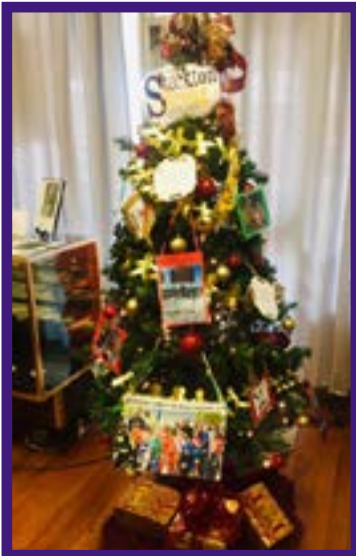
Stockton Strong's Christmas tree.