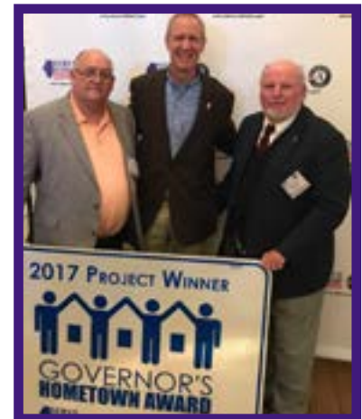
Lanark Area Community Foundation Board Members pose with Governor Bruce Rauner.