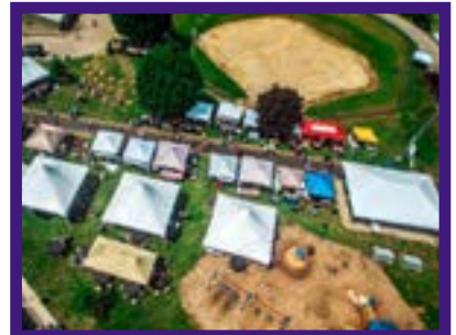
Garlic Fest underway in Elizabeth.