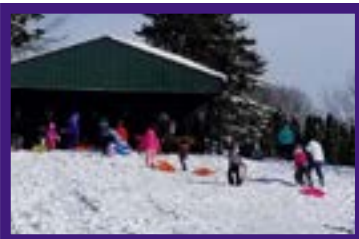
Kids enjoying a sledding day in Walnut.