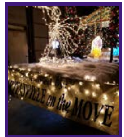
Martinsville on the Move float for tonight's Parade of Lights.