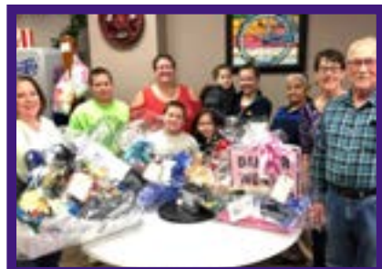
Basket winners during Oregon Together's Chocolate Walk.