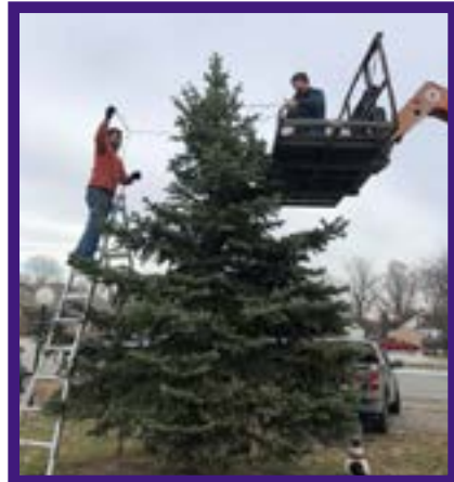
Volunteers in Neoga preparing the town Christmas tree.