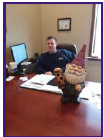
Strasburg's Traveling Gnome Gnorman traveling to area businesses to highlight what they have to offer.