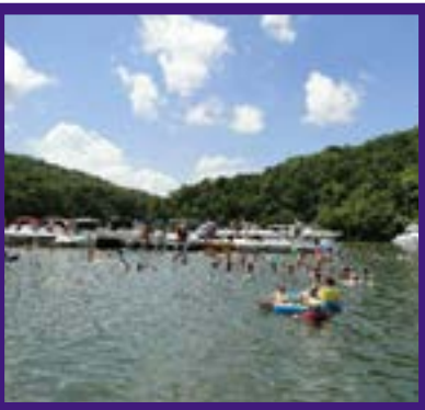
Hillsboro residents enjoying the lake before the Cardboard boat Regatta.