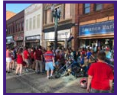
Residents kicking off the 4th of July weekend with the First Friday in downtown Savanna.