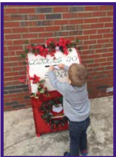
Hillsboro resident sending their letter to Santa