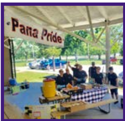
Pana Pride Cookout.