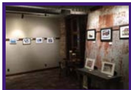
Oregon Together's "Winter 61061" photo show.