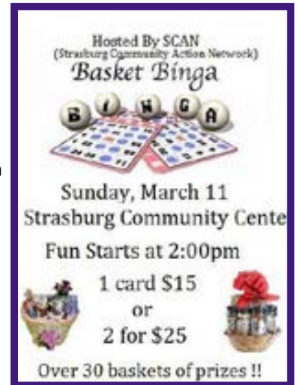
Strasburg's Basket Binga Flyer.