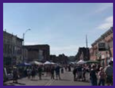
Hillsboro's annual European Style Harvest Market.