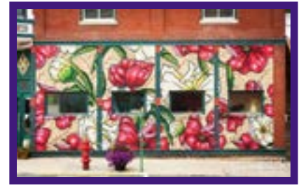
New Mural in Stockton painted during the NW IL Art and Jazz Fest.