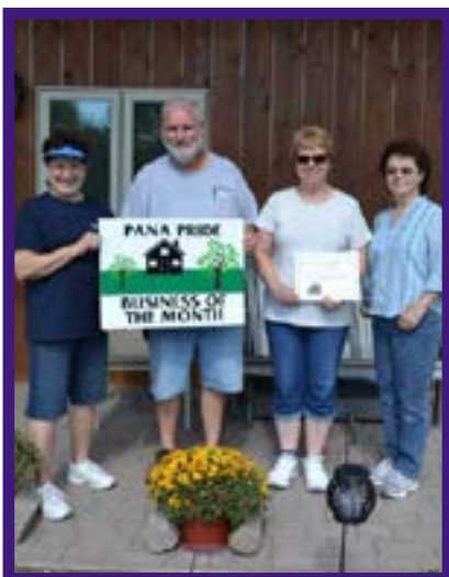
Pana Pride presenting the Business of the Month award.