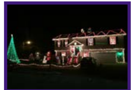
Christmas Light competition winner in Creve Coeur.