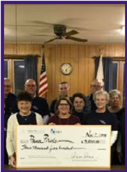
Pana Pride received an award of $3,500 for excellent performance in the Elevate Community Challenge.