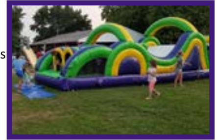
Kids enjoying a bounce house in Assumption before the movie.