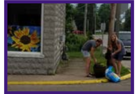
Volunteers planting flowers downtown in Downs.