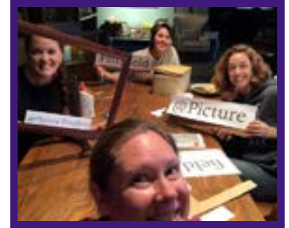
Picture Pittsfield getting prepared for their Girls Night Out Social Media Event.