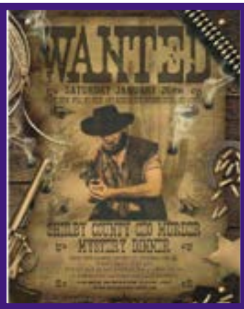
Shelby County promoting the CEO student event.