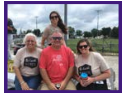
Winchester locals showing off their 'Be Local Winchester' shirts.