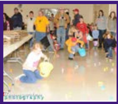
People enjoying Easter festivities in Stewardson.