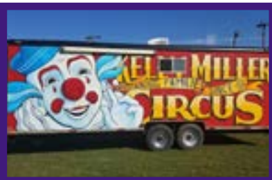
The circus has arrived in Assumption.