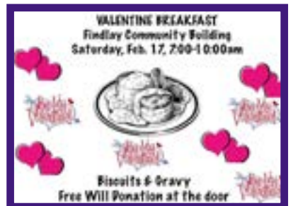
Findlay's Valentine Breakfast Flyer.