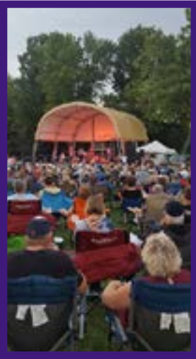
Residents enjoying the concert at Windsor Harvest Picnic.