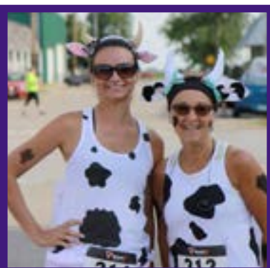
Participants getting ready for the 2018 Hoofin' to the Cow race in Stewardson.