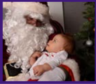
A photo with santa in Stewardson.