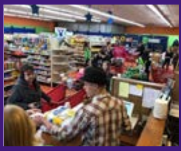
Participants in the Walnut Cash Mob at the Walnut Acres Country Store.