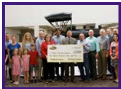
$100,000 was donated by the Etnyre Foundation to support the Black Hawk Statue Restoration.