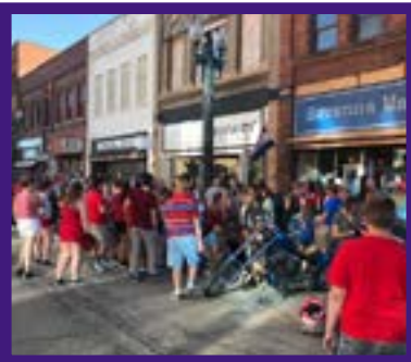
Residents kicking off the 4th of July weekend with the First Friday in downtown Savanna.