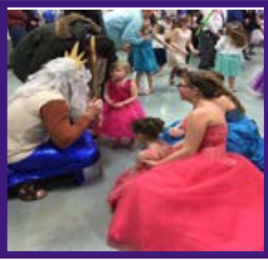
Hillsboro's Father Daughter Princess Ball.